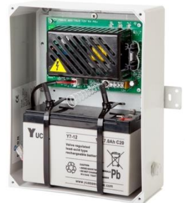
IP65 'W' box